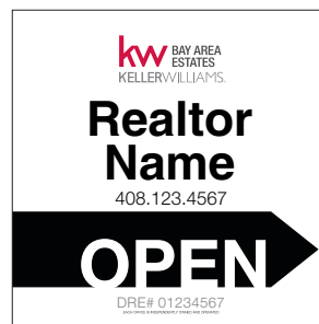
EXAMPLE SIZE: 24IN X 24IN SIMPO A-FRAME