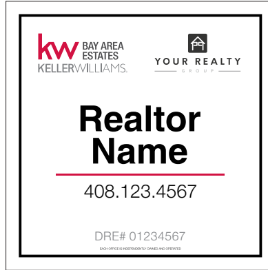
EXAMPLE SIZE: 24IN X 24IN WITH AGENT LOGO