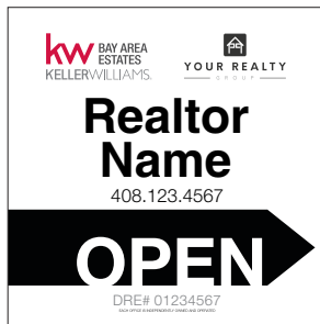
EXAMPLE SIZE: 24IN X 24IN WITH AGENT LOGO