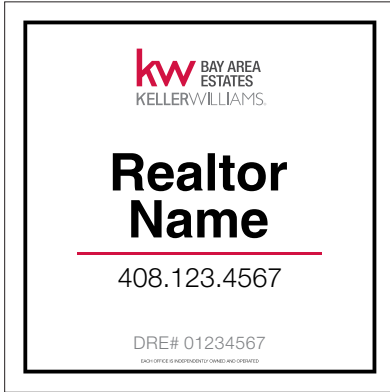
EXAMPLE SIZE: 24IN X 24IN STANDARD

Please send all orders through fax or e-mail. Thank You!