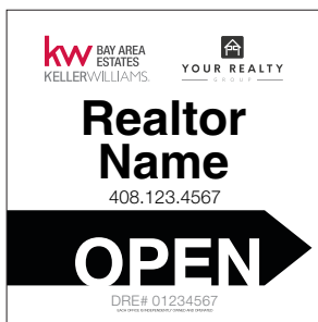
EXAMPLE SIZE: 24IN X 24IN WITH AGENT LOGO