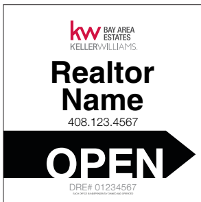
EXAMPLE SIZE: 24IN X 24IN STANDARD