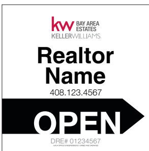
EXAMPLE SIZE: 24IN X 24IN STANDARD